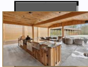
Outdoor Reception & Celebration Area